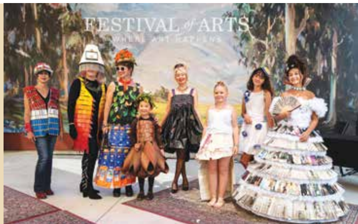
Artists and juniors wowed at the Festival of Arts Runway Show, where recycled materials became wearable masterpieces

For more, visit www.foapom.com or follow @FestivalPageant.