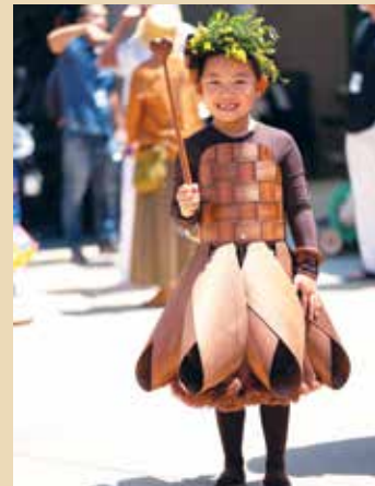
Most Glamorous 'Red Carpet' Worthy Creation and the People's Choice Award